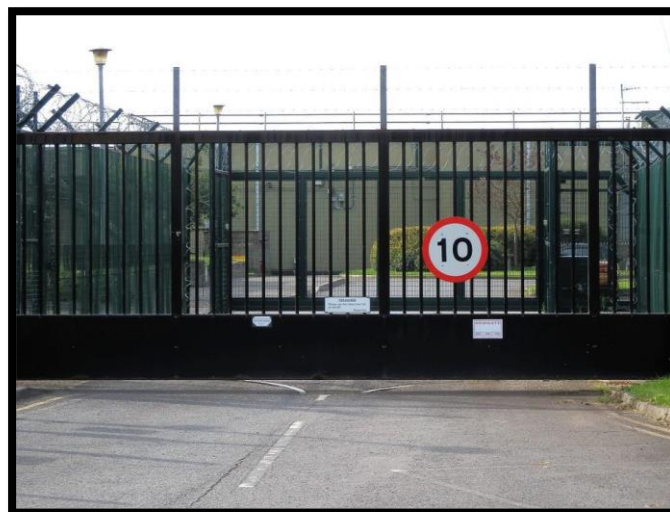
Original Main Gate Arrangement