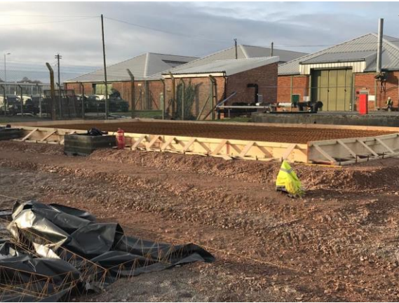
Backfill void & set up formwork for new slabs