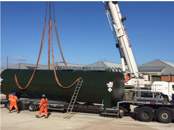
Contract lift new 60,000ltr fuel tank onto new concrete slab