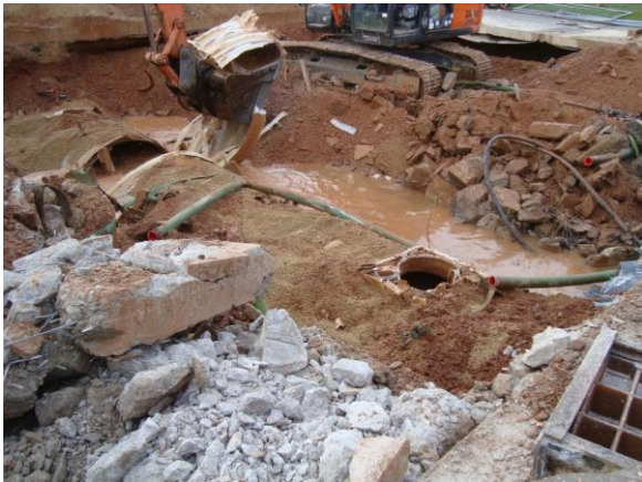
Excavate existing fuel tanks for removal off site