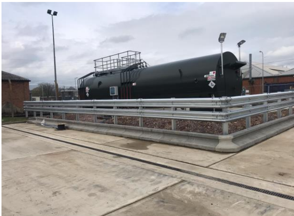
New operational fuel tank