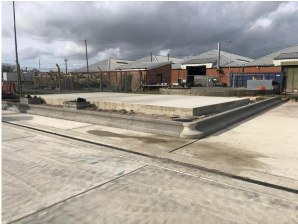
Cast new r/f concrete slabs, lay Aco channels & Trief kerbs