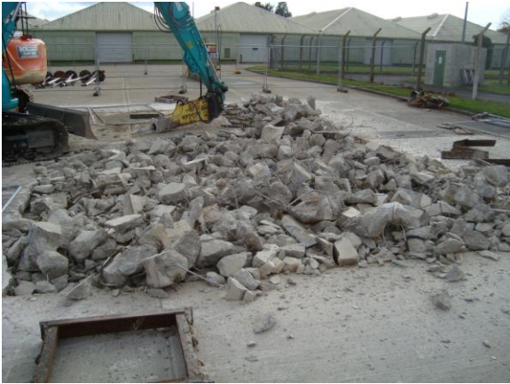
Break out of r/f concrete slabs