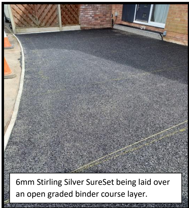
6mm Stirling Silver SureSet being laid over an open graded binder course layer.